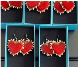
Sealskin hearts « Mini Love » earrings