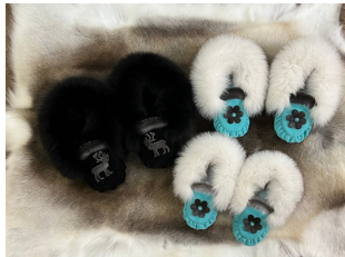
Sealskin fox fur slippers