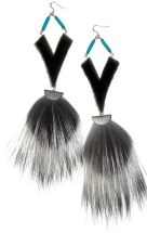
Signature sealskin fox earrings