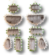
Sealskin Inukshuk earrings