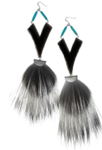
Signature sealskin fox earrings