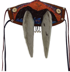
'Bounty of Our Land' pandemic mask