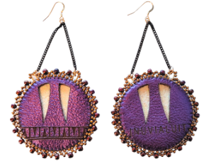
Laser cut walrus tusk sealskin earrings