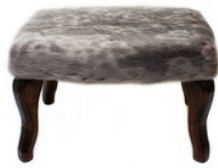
Sealskin vintage footstools