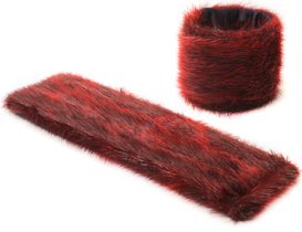
Sealskin snap cuffs in natural or dyed Harp Seal or Ringed Seal