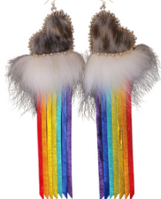
Sealskin heart rainbow fringe earrings