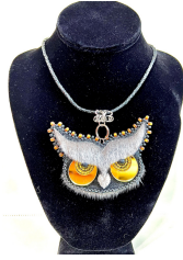
Sealskin owl pendant