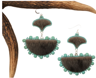
Sealskin Ulu earrings