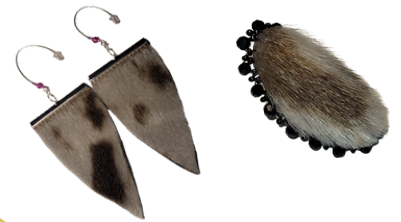
Sealskin earrings and rings