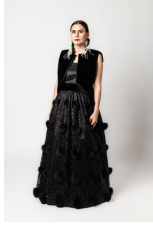
'Inuvialuk at the Met Gala' couture outfit